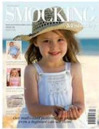
Australian Smocking and Embroidery Issue # 88

This issue includes a sundress, a baby boy's bubble, several dresses and a beautiful smocked purse.