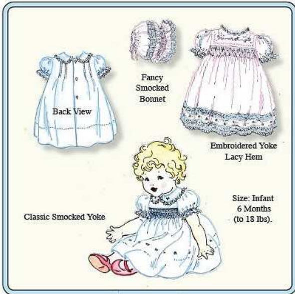
Emma's Smocked Baby Clothes Size Infant to 6 mo (18 lbs.)