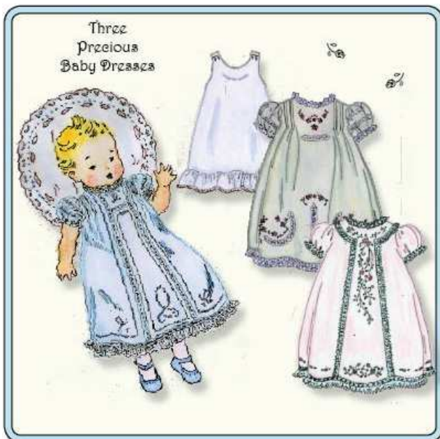
Here are 3 patterns from Old Fashioned Baby – 2 new and one revised