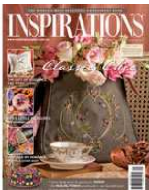
Inspirations Issue 63

This issue includes a sundress, a baby boy's bubble, several dresses and a beautiful smocked purse.