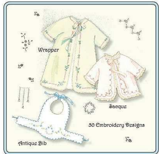
Baby Sacque and Wrapper with Embroidery Designs