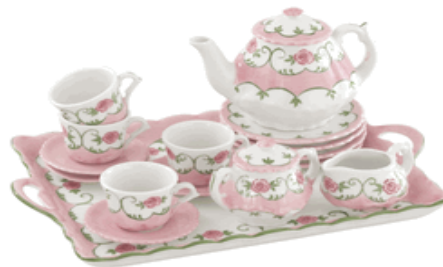
'Eloise' Floral 18 pc Tea Set