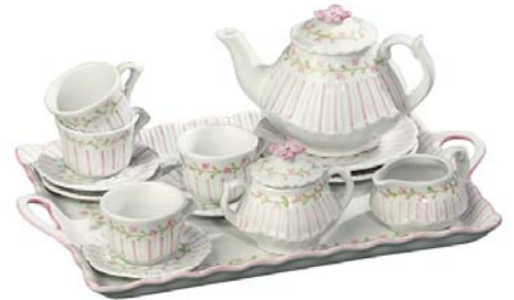
Pink Pinstripe 18 pc. Tea Set

I have carried these tea sets, purse banks, and the doll tea set for several years - they are wonderful to share with your favorite little girl! With my recent shipment, I was notified that the manufacturer will no longer accept wholesale orders for these - they will only accept manufactures orders (need to order the whole-production run). Since I am not going to order several hundred of these at a time, when my current stock is gone, I will not be getting any more. I have already pulled out a set or two to put in my Grammy Hope Chest (for whenever that will be!), but the rest are up for grabs! Each tea set includes 4 plates/4cups/4 saucers/ sugar bowl & lid/creamer/tea pot & lid/tray. The plate is big enough to hold a couple of cookies.