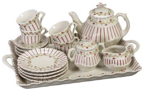
Red Pinstripe 18 pc Tea Set