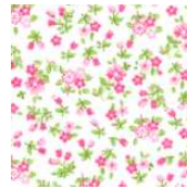
Pink Floral Pique'