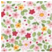
Pink Floral Twill

This fabric is a closeout – it will no longer be carried by the manufacturer, so the price is perfect! The fabrics are all 100% cotton and 54 inches wide. They regularly retail for $16.00 / yd, but until they are gone I will have them for $8.00 / yard! This is first come first serve, so if you want any, please email me right away and let me know. I will not put them on my website until Feb.1, to give my newsletter ladies first dibs!