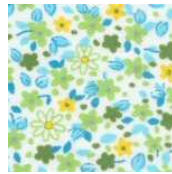
Blue Floral Twill