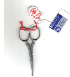
1-Nub Lace Scissors $34