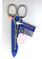
2–Nub Lace Scissors $38