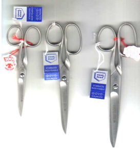
Shears 5 inch - $36 6 inch - $43 7 inch - $48

Last newsletter, I had the wonderful DOVO lace scissors, and the response was soo good, I have decided to carry a few more of their scissors. In addition to the 1-nub lace scissors, I know carry the 2-nub scissors, a 3 ½ inch embroidery scissor, the 5 inch shear, the 6 inch shear, and the 7 inch shear. In addition to these, I am also introducing a new style that DOVO has just released – a 3 ½ pair of SHEARS!