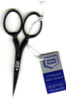
Embroidery Scissors $32