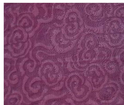
Purple Swirl Silk Organza