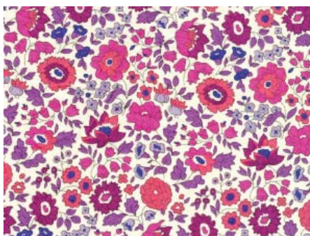
Raspberry/ Blue Liberty of London